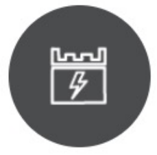
Resilience and Security